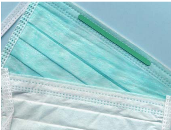
Surgical masks and covers

We project lines for the production of different nonwovens in all application areas and offer them as turnkey installations. Either domestic or technical textiles can be produced. Possible application areas are floor coverings, automotive linings, geotextiles, filter media, synthetic leather or natural fibre felts. Furthermore we offer installations for the production of disposables which are used in cosmetics, medicine and hygiene.