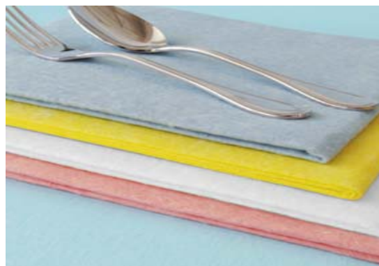
Wipes for household and industry