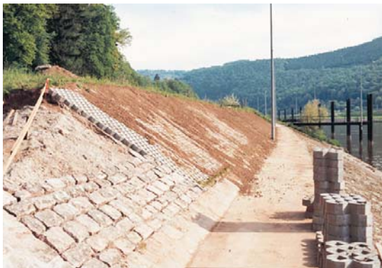
Bank reinforcement with geotextile

Participating at the INDEX show is a tradition for the DiloGroup. On a booth of more than 100 m 2 the companies of the DiloGroup – DiloTemafa, DiloSpinnbau and DiloMachines – will provide widespread information about numerous applications of nonwovens showing various products. Our experts will be available to hold technical discussions with you.