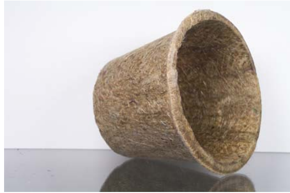
Plant pot made of natural fibres

We project lines for the production of different nonwovens in all application areas and offer them as turnkey installations. Either domestic or technical textiles can be produced. Possible application areas are floor coverings, automotive linings, geotextiles, filter media, synthetic leather or natural fibre felts. Furthermore we offer installations for the production of disposables which are used in cosmetics, medicine and hygiene.