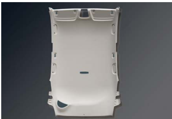
Automotive head liner